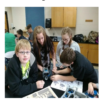
The 4-H After-School Robotics Club in Iosco County received a $1,000 Michigan 4-H Legacy Grant to use VEX Robotics as a tool

Michigan 4-H Legacy Grants of $1,000. These grants are awarded to support development of a new program or initiative or to strengthen, enhance or expand a current program that is making a difference.